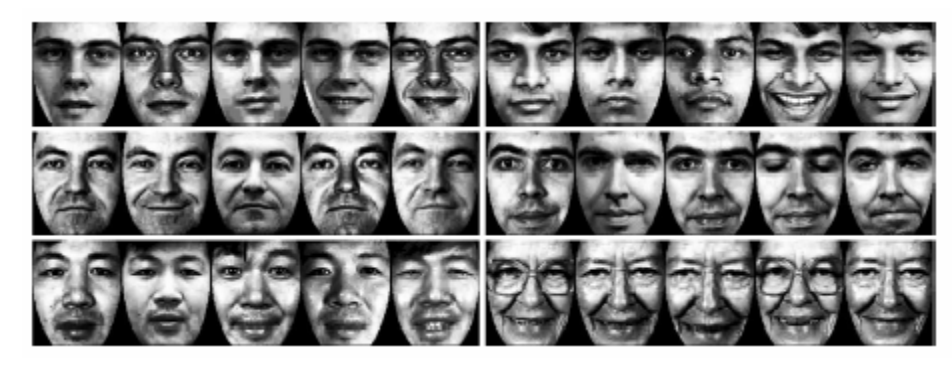
Figure 2: Example of Six Classes Using LDA<sup>8</sup>

LDA is a statistical approach for classifying samples of unknown classes based on training samples with known classes.<sup>4</sup> (Figure 2) This technique aims to maximize between-class (i.e., across users) variance and minimize within-class (i.e., within user) variance. In Figure 2 where each block represents a class, there are large variances between classes, but little variance within classes. When dealing with high dimensional face data, this technique faces the small sample size problem that arises where there are a small number of available training samples compared to the dimensionality of the sample space.<sup>7</sup>